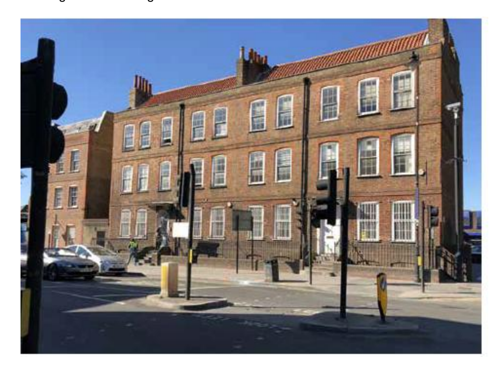
Proposed view from the High Road